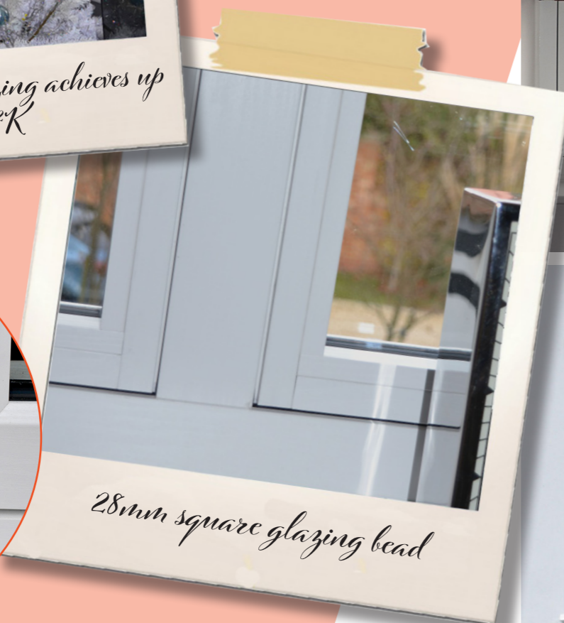
28mm square glazing bead