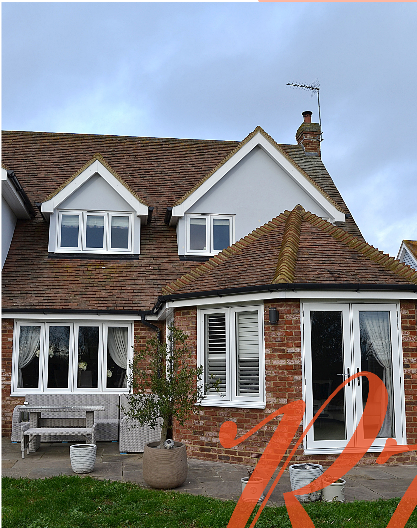
RESIDENCE 7 WINDOWS AND DOORS | GRAINED WHITE ● GRAINED WHITE