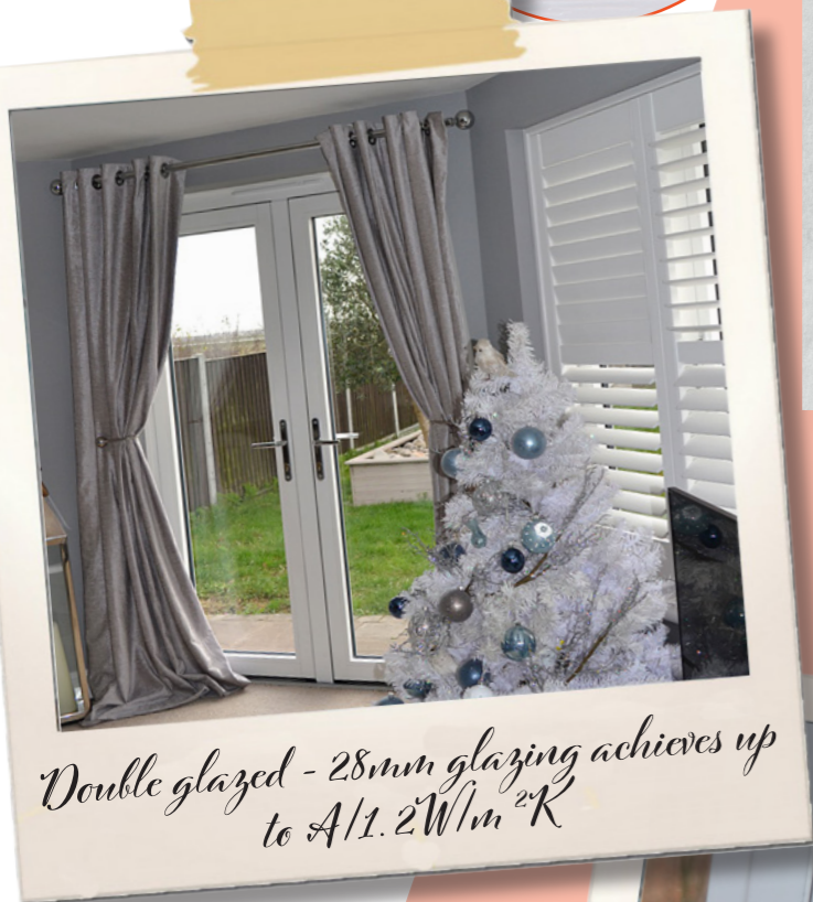
Double glazed - 28mm glazing achieves up to A/1.2W/m 2 K